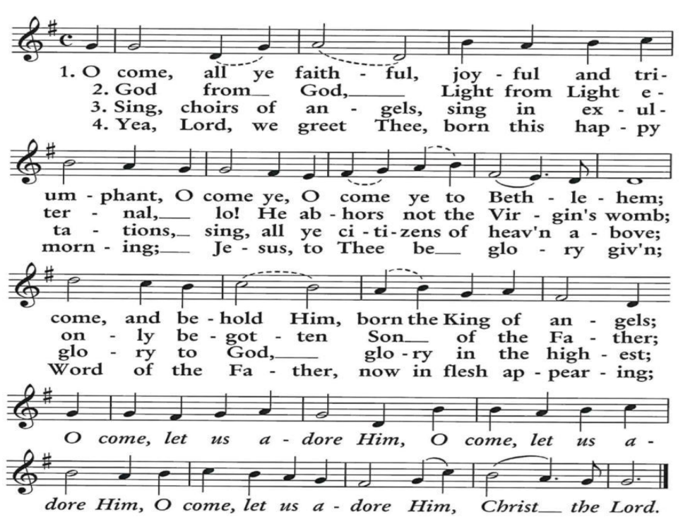
words: J. F. Wade; trans. F. Oakeley and others; music: Adeste fideles, melody att. to Wade